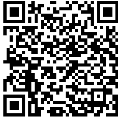
QR Code for Payment Center