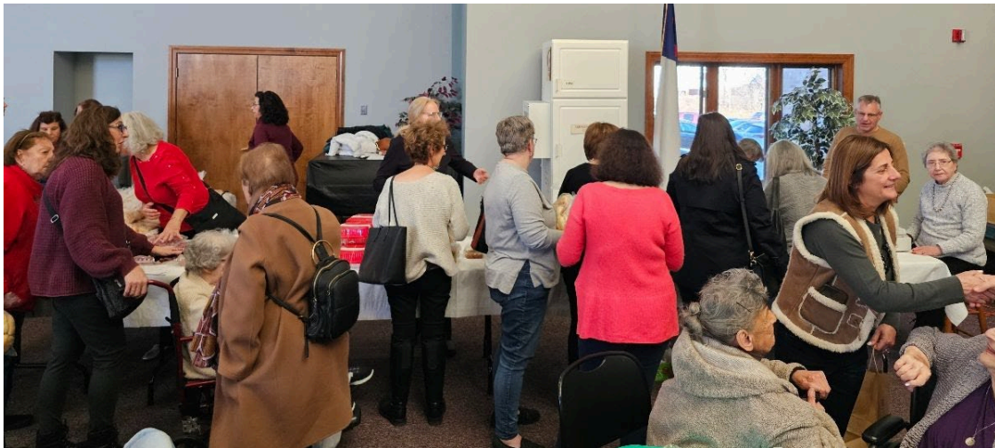
Below: The always crowded Baked Goods table.