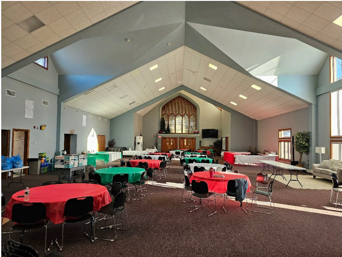
The hall is set!

Thank you to everyone who supported this event, we look forward to seeing and serving you next year!