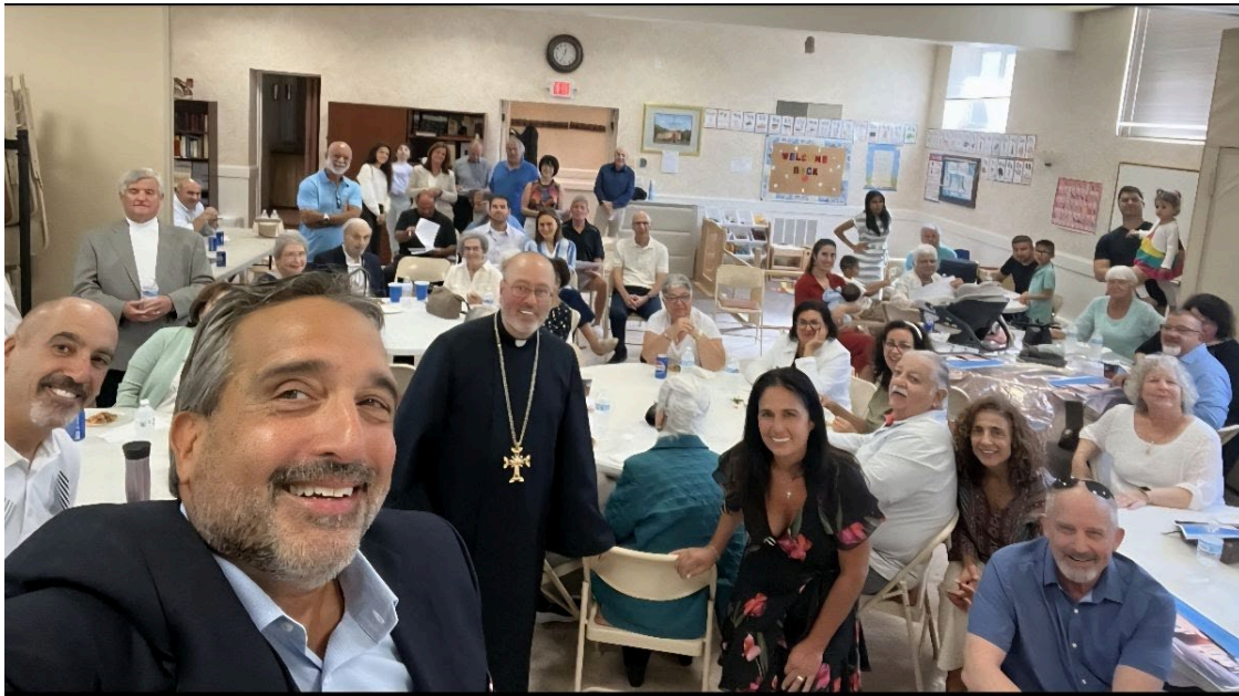
Above: Members smiling and ready to start the special meeting!

Stay tuned .....There's more to this story!