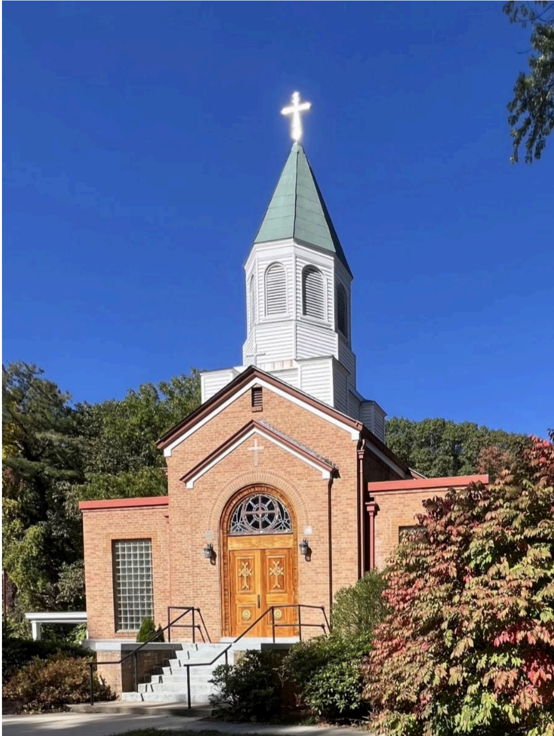
The cross atop our church shining brightly on October 5