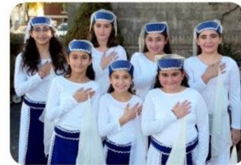
Hamazkayin Artsakh Dance Group performs Saturday & Sunday at 5:00