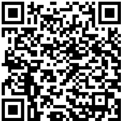
QR Code for Donations

Donations Event Payments Membership Stewardship